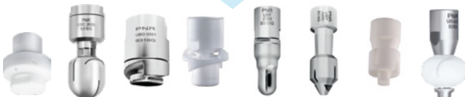
UBB UBC UBD UBD A UBF UBF A UBF S UBX

D RINSING AND REMOVAL OF LIGHT SOILING FREE SPINNING TYPE