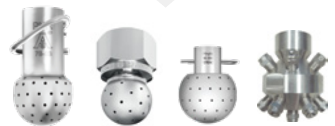
UA3 UAB UAC CH